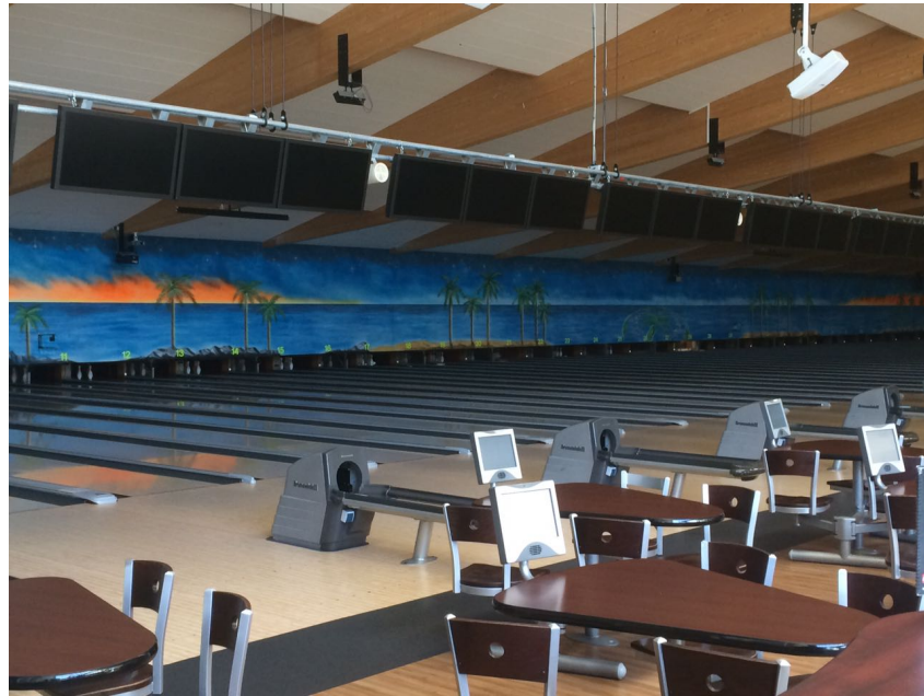
Dream-Bowl Palace - Lanes